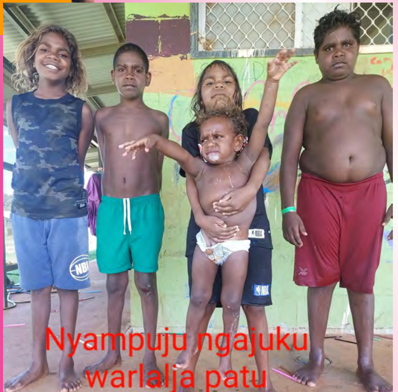
Nyampuju ngajuku warlajja patu