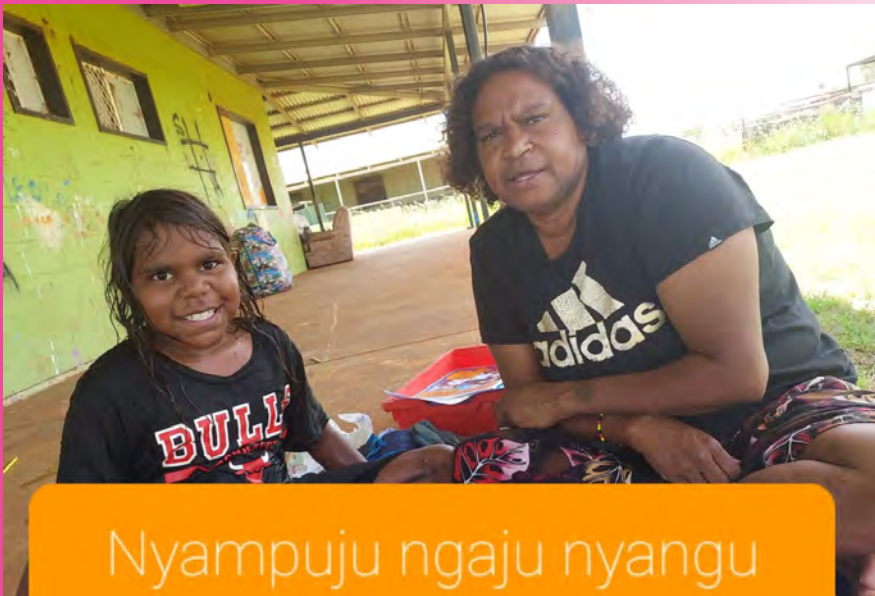
Nyampuju ngaju nyangu Warringi

We have been learning about the Warlajja Theme and reading Warlpiri books together. We have been playing football and games at the basketball court. We have been cooling off swimming at the pool!